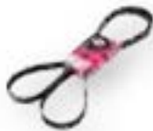
Micro-V® Horizon™ multi-ribbed belt